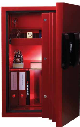
In picture Keeps® S-200 model.